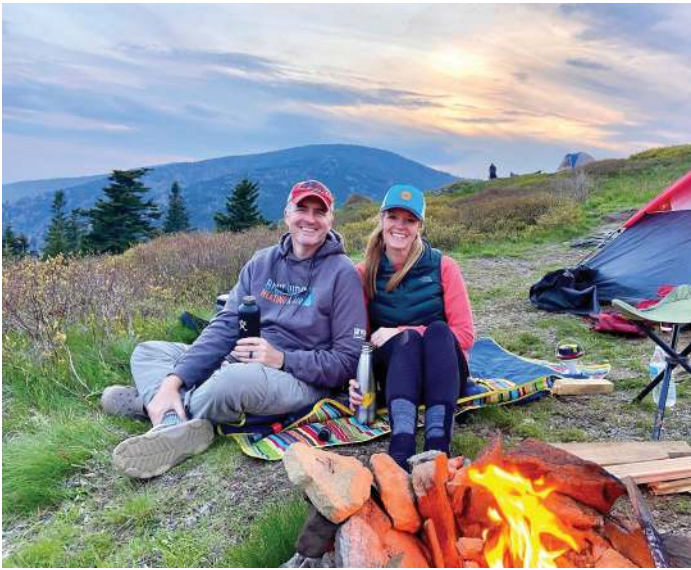
The Lagranges really enjoy camping and being outdoors. This trip was on the Appalachian Trail.

The Lagranges live in Pelham Falls. They love the convenience of the location and the neighborly feel. They'll occasionally play tennis at the neighborhood courts, and in the summer, they spend a lot of time at the neighborhood pools.